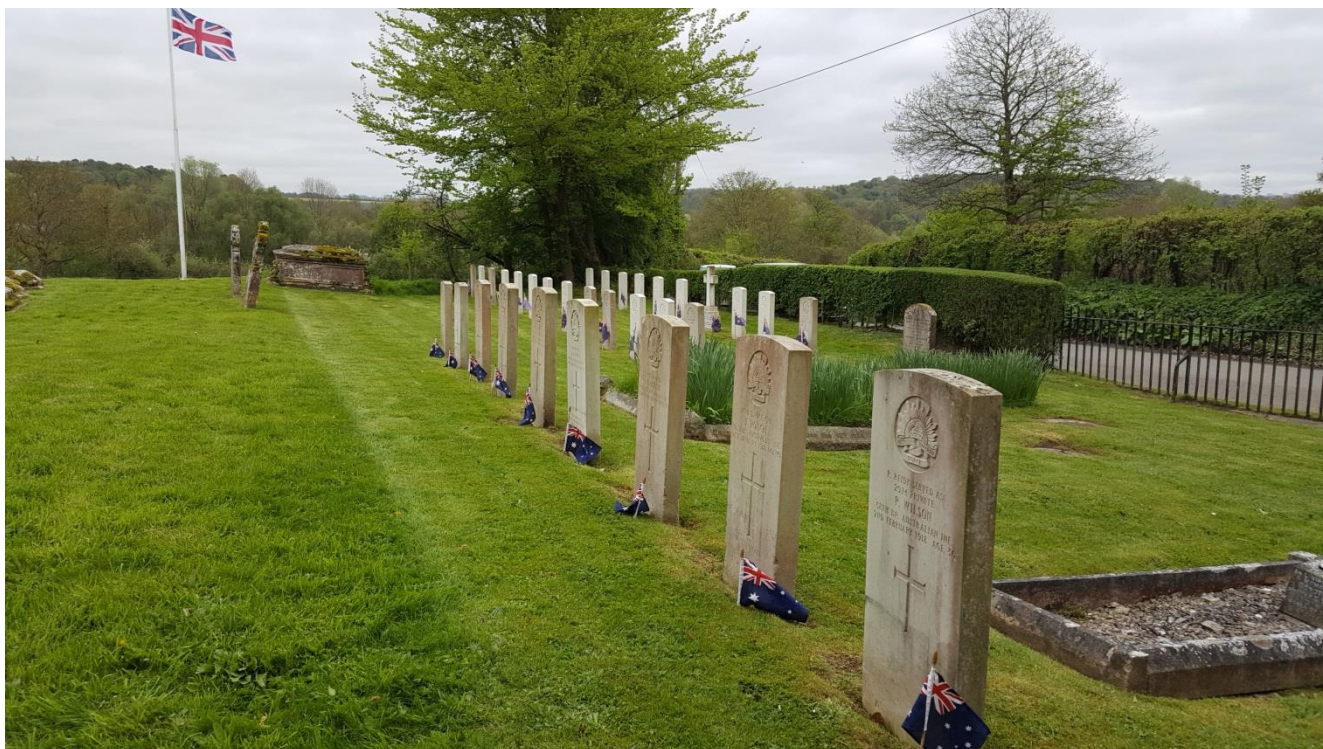
St. Edith's Churchyard, Baverstock